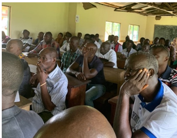
Educaid Teachers Training, teachers carefully following the principles of contemporary teaching (September 2019)