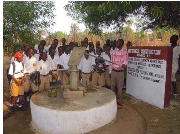
Water and sanitation program to improve the level of hygiene in Yele (2011-2016)