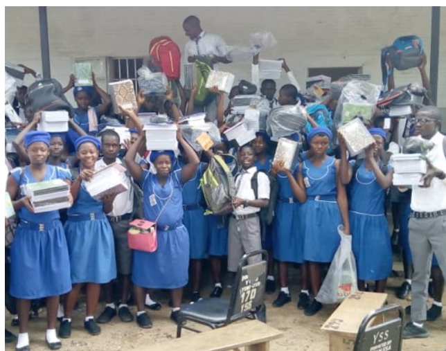
School girls receiving school uniform and school materials (October 2019)