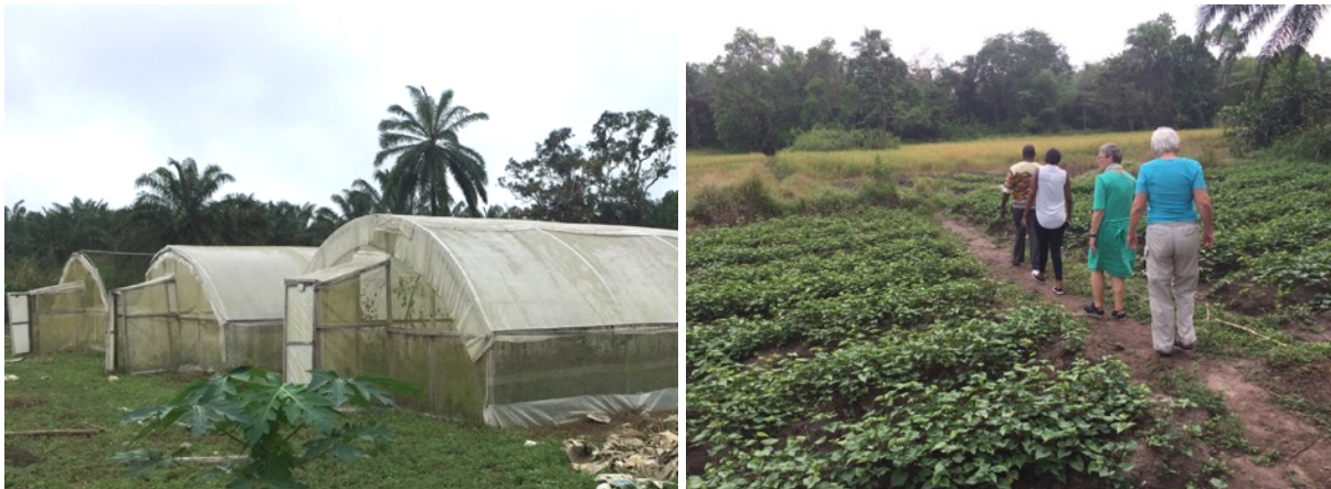
The greenhouses behind the Child Care Center and farm next to it

Behind the child care center is a large garden, where vegetables are grown, partly in plastic greenhouses. Due to harsh weather conditions, some greenhouses roofs were ravaged. Nonetheless, there are plans to construct better greenhouses, install an irrigation system with a solar panel-driven water pump, to bridge the period of severe drought. With this, the young people can get started and learn new farming techniques.