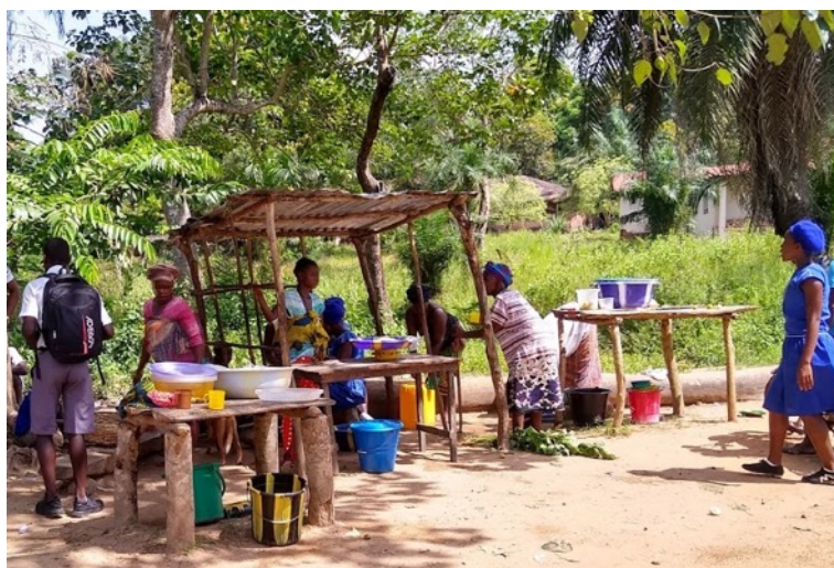
Women from Yonibana selling lunches and fruits close to the school gate