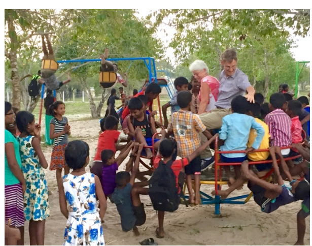
School children playing after their evening classes