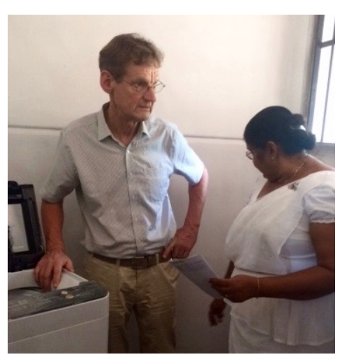
The reception at Sasara