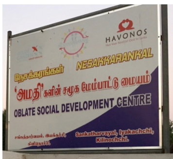
Learn/work farm in Iyakachchi: a showpiece of the Oblates