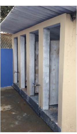
New showers with well and water tank