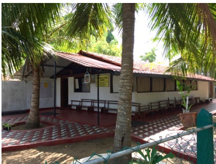
New school building