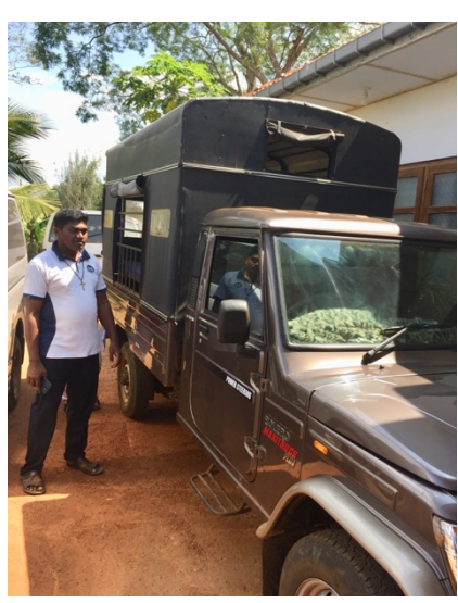
New Pick up